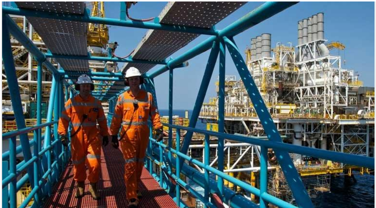
A platform at the Bayu-Undan field.

By Damon Evans 5 September 2019 Asia Pacific / Exploration & Production