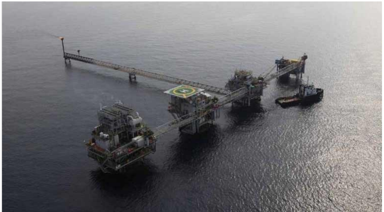
A flow station off Indonesia.