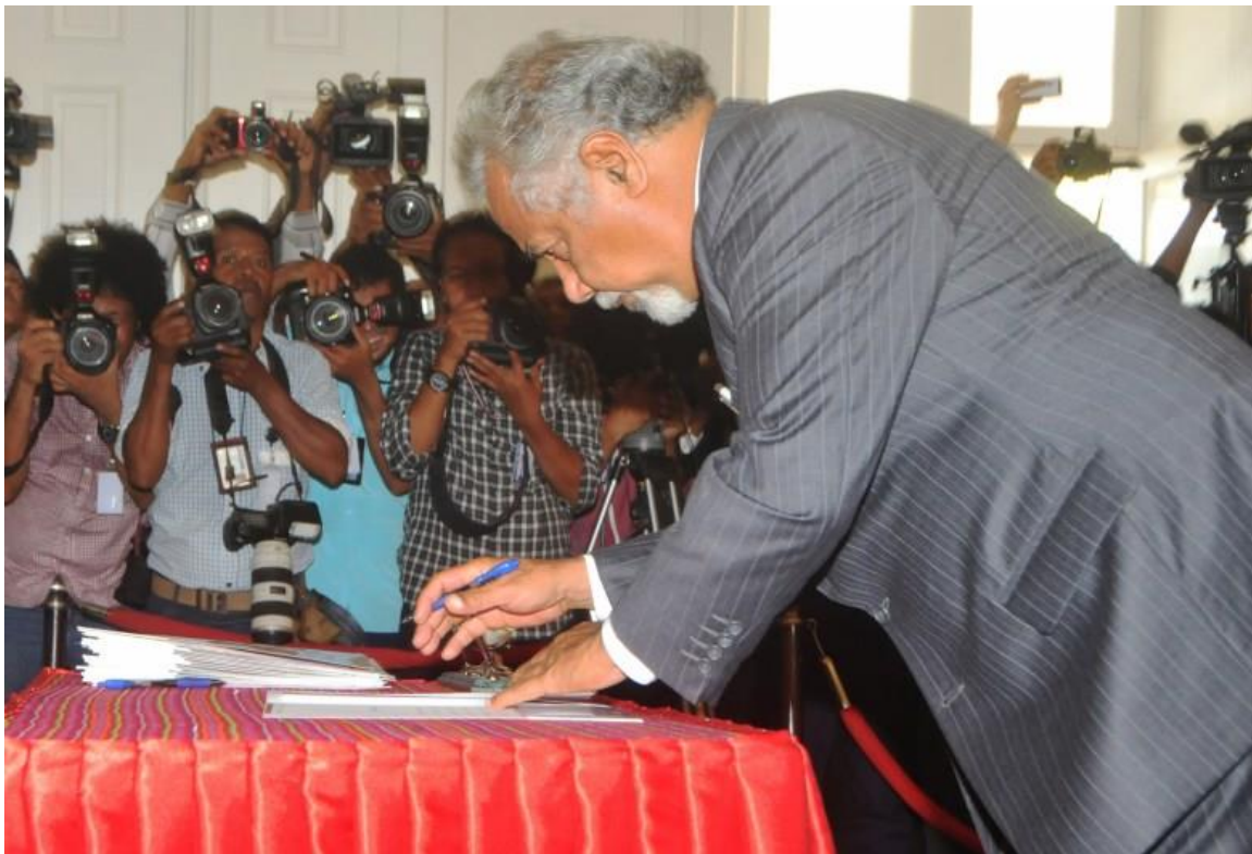
Timor-Leste's Xanana Gusmao signs his appointment paper as minister for planning and strategic investment following a swearing-in ceremony on February 16, 2015.

The spying revelation enabled Timor-Leste to drag Australia into the Permanent Court of Arbitration at The Hague for conciliation proceedings that resulted in it gaining a much more favorable maritime border, though Indonesia's agreement to the lateral boundaries on either side could be a new question.