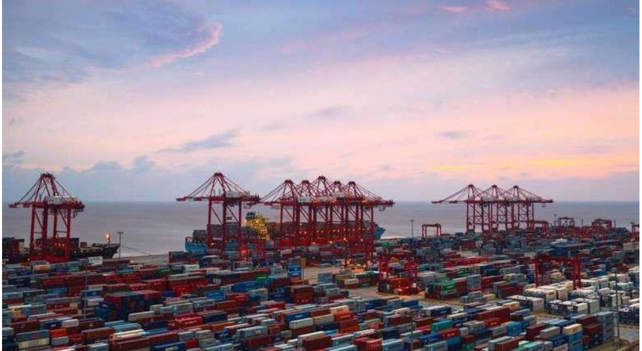
China provided finance for Dili's new container port.