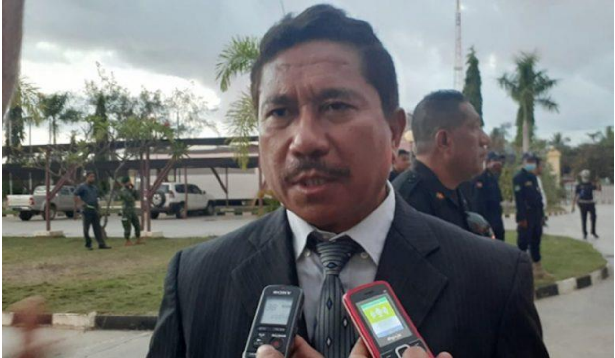
Timor-Leste's Victor Conceicao Soares takes questions from the press in a file photo.

“There are so many Timorese who are still living under [the] poverty line, we have [a] high youth unemployment rate, the country is still heavily dependent on imports of goods and basic needs from other countries and our agricultural sector is still on a subsistence basis,” he added.